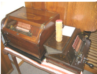
DRUM ORGANS See story on Page 3